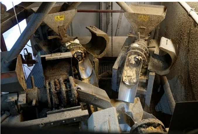
Photo 4: Oil presses are common in soya bean processing. In this case, four presses are combined.