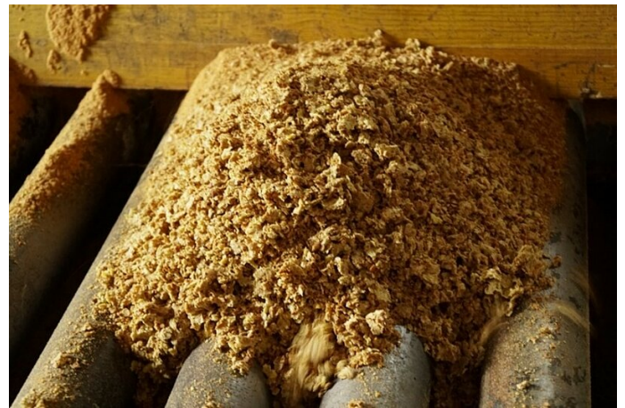
Photo 3: Soya bean cake is the product after heat treatment and oil pressing. Before feeding, it is usually mixed with other feed ingredients.