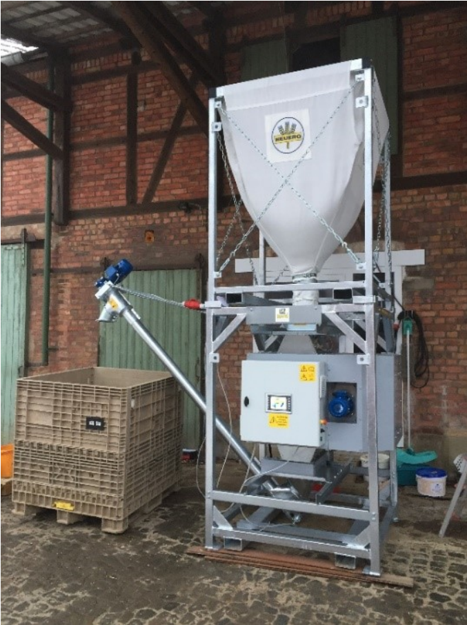
Photo 1: Toasting technology treats soya beans with steam or hot air.