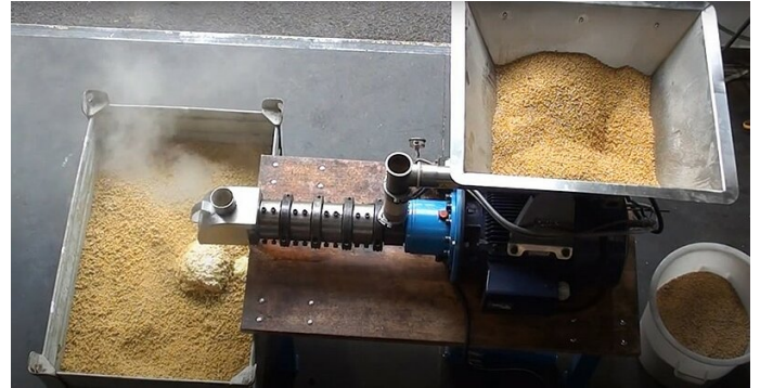
Photo 2: Extrusion technology uses a combination of pressure and friction to generate processing temperature.