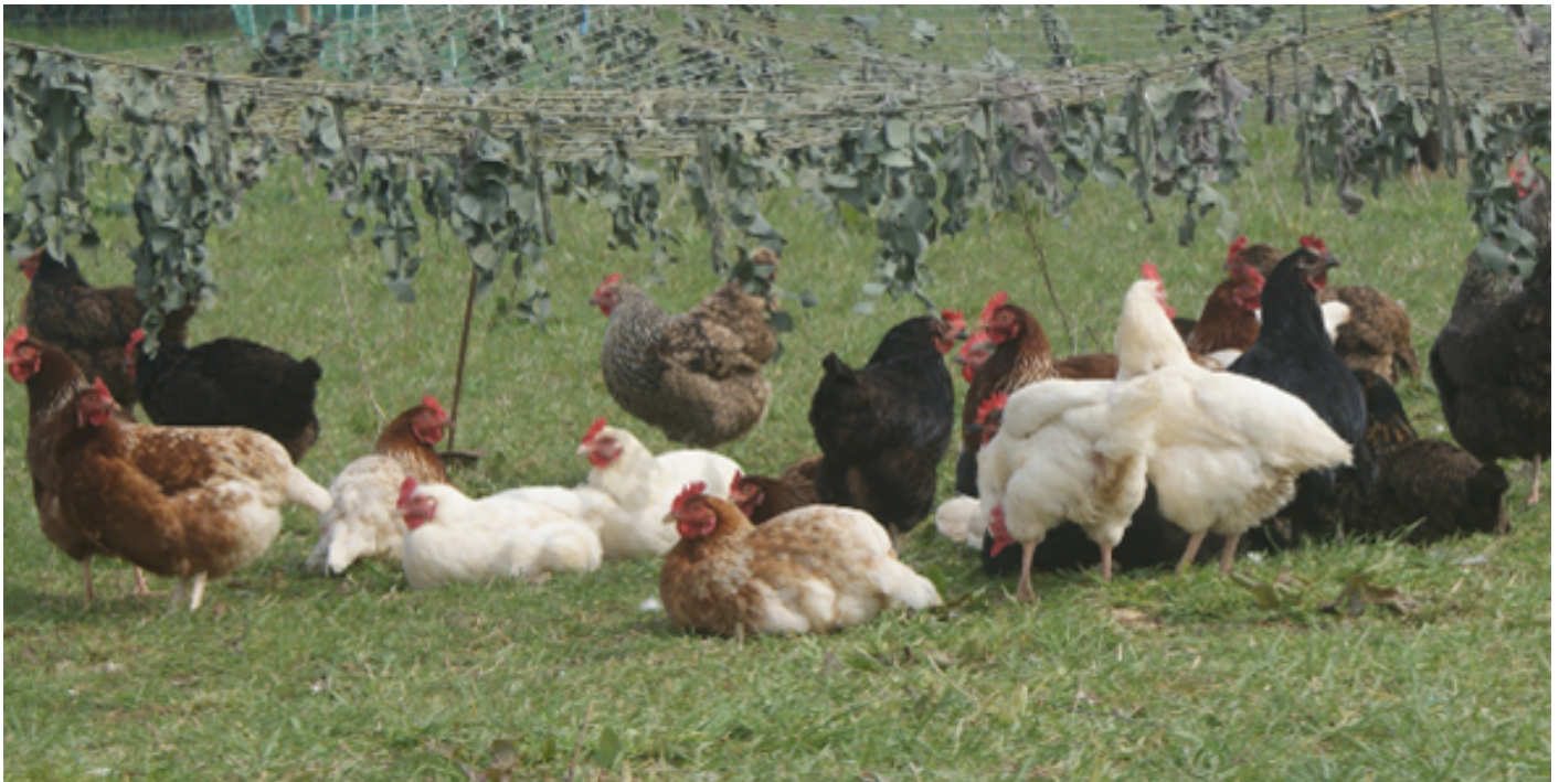
Figure 1. Forage can provide significant food for organic broilers

Key to this is range management and alternative forages, such as baled haylages, which will be needed during winter or drought periods. High protein sources such as lucerne and clovers can also supply some of the required protein. Account can also be taken of insects and invertebrates eaten on the range, which can supply some of the protein and amino acids required.