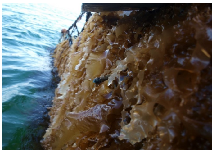
Figure 1: Brown seaweed, sugar kelp.