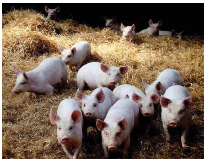
Figure 2: Organic piglets may benefit from seaweed.